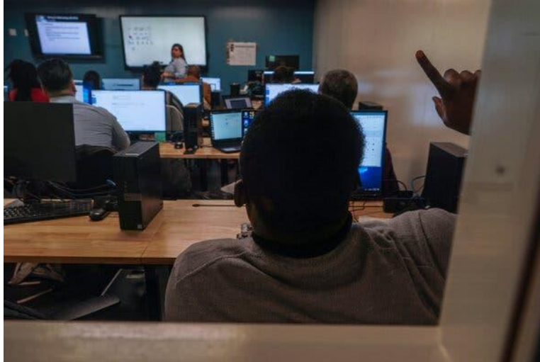
The comprehensive job training approach has been honed by nonprofits like this one from Per Scholas in the Bronx.

To streamline such work, the Center for Workforce and Economic Opportunity at the Federal Reserve Bank of Atlanta is building metro area websites and developing programs to help career coaches across the country pinpoint local job openings and relevant training. The websites rely on data from Emsi and Burning Glass Technologies , labor market research firms.